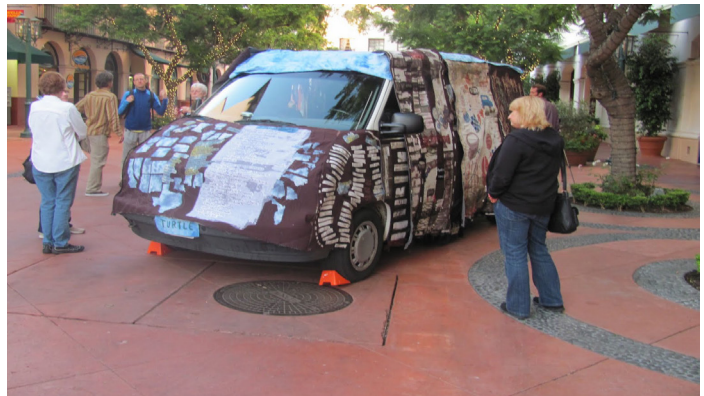
Did you see this quilted van at first Thursday in November?