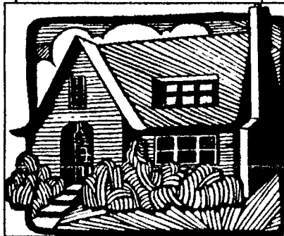
Home is where the quilts are

NOTICE: Elections for all Board of Director positions will be held at the November meeting.